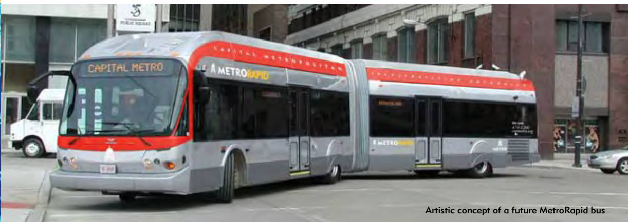
Artistic concept of a future MetroRapid bus